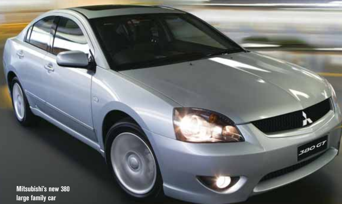
Mitsubishi's new 380 large family car