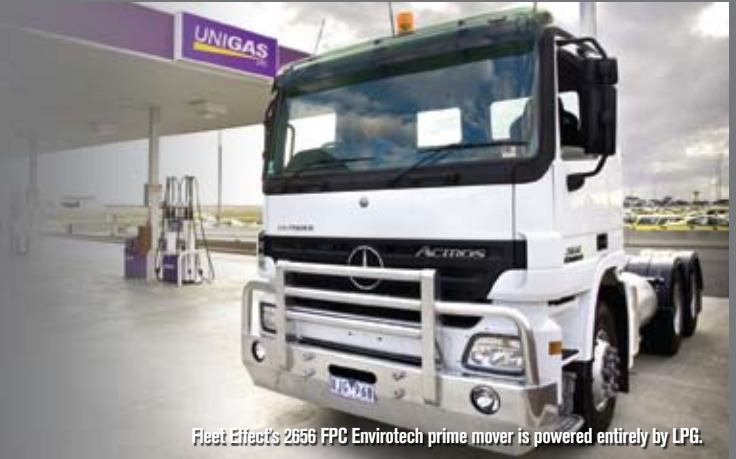
Fleet Effect's 2656 FPC Envirotech prime mover is powered entirely by LPG.

The world's first heavy truck powered entirely by LPG was unveiled at the inaugural International Trailer, Truck and Equipment Show in Melbourne in May.